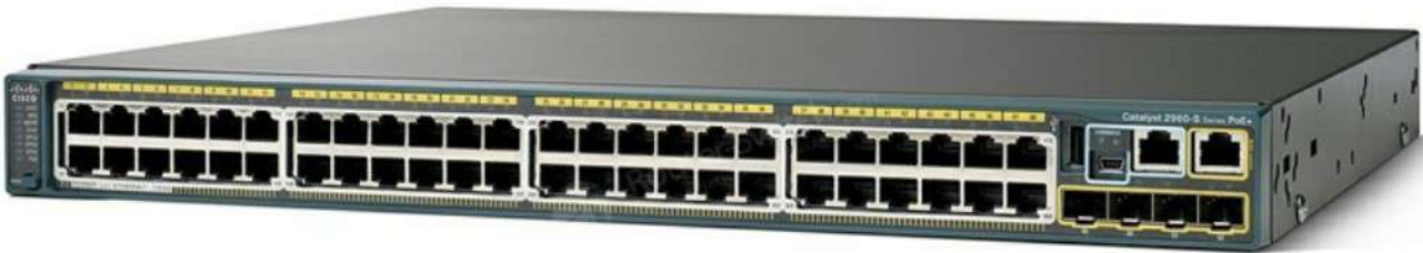
Table 1 shows the Quick Spec of the WS-C2960S-48FPS-L.

Figure 1 shows the appearance of the WS-C2960S-48FPS-L.