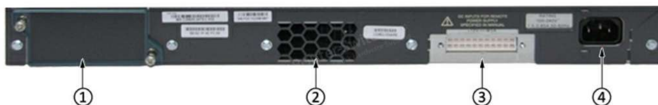
Figure 3 shows the back panel of the WS-C2960S-48FPS-L.