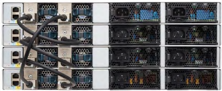
Figure 4. Cisco Catalyst 9200 Series Switch stacked units

Cisco Catalyst 9200 Series switches also come with dual fans and support redundancy. Cisco Catalyst 9200 Series switches support redundancy with dual fans. On the C9200 SKUs, the fan units are field-replaceable, whereas on the fixed C9200L SKUs, the fan units are fixed. C9200CX SKUs are fanless.