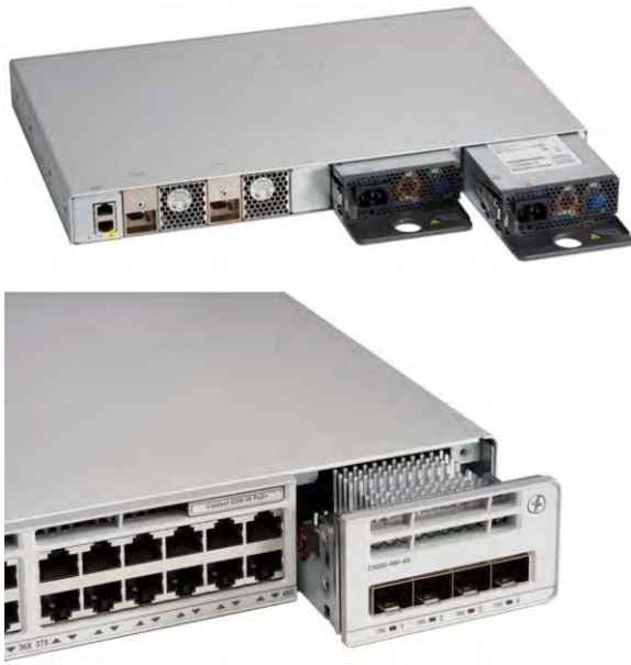
Figure 3. Cisco Catalyst 9200 Series Switch dual redundant power supplies

Table 4 lists the PoE power availability for each model.