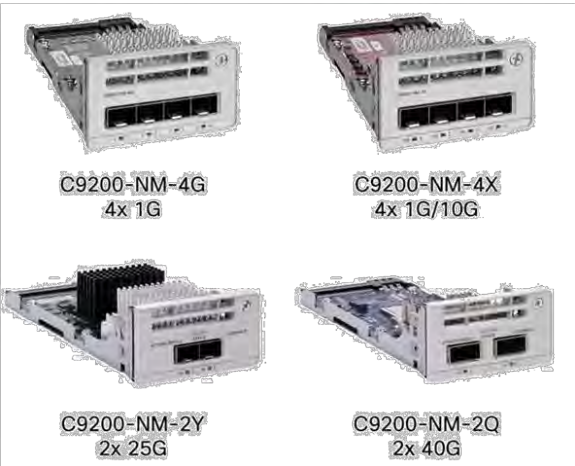
Figure 2. Cisco Catalyst 9200 Series Switch network modules

Cisco Catalyst 9200 Series switches come with modular or fixed uplinks as indicated in Table 1. With modular SKUs, the field-replaceable network modules provide infrastructure investment protection by allowing a nondisruptive migration from 1G to 10G and beyond. When you purchase the switch, you can choose from the network modules described in Table 3.